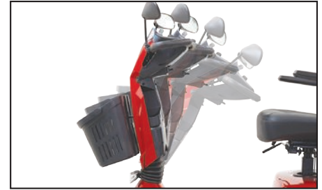
Infinite adjustable tiller with ergonomic design