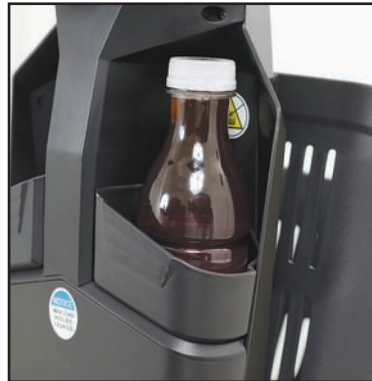
Conveniently located drink holders