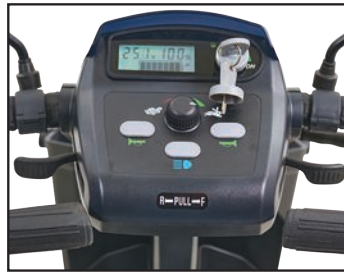
Digital Dashboard & User-friendly auto-tiller adjustment