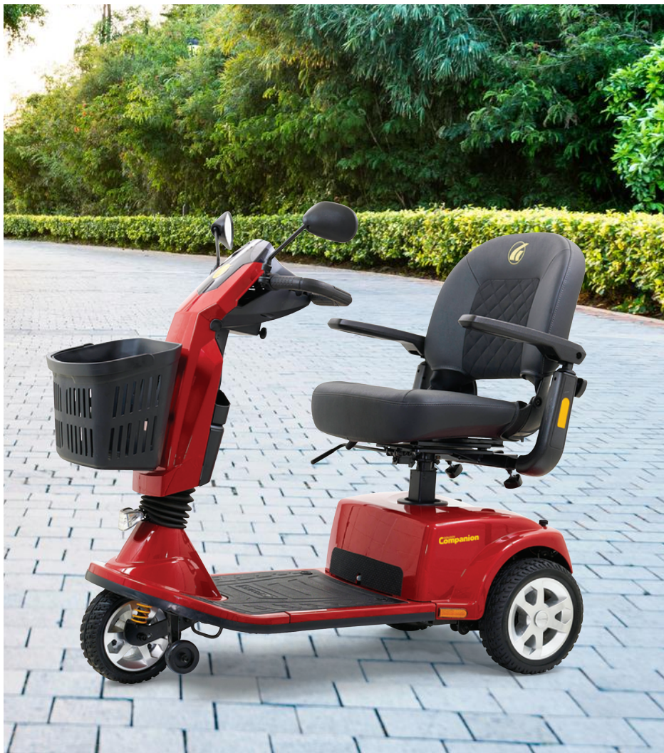
Shown with Power Elevating Seat