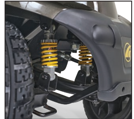
Front and rear suspension for a smooth ride