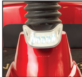
Front and rear lights and side reflectors for safety