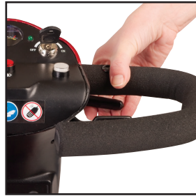
User-friendly auto-tiller adjustment