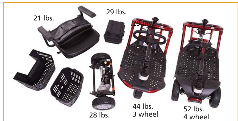
Disassembles into six pieces for transport and storage! No wires to connect or disconnect!