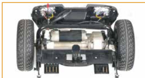
Quiet & maintenance free motor