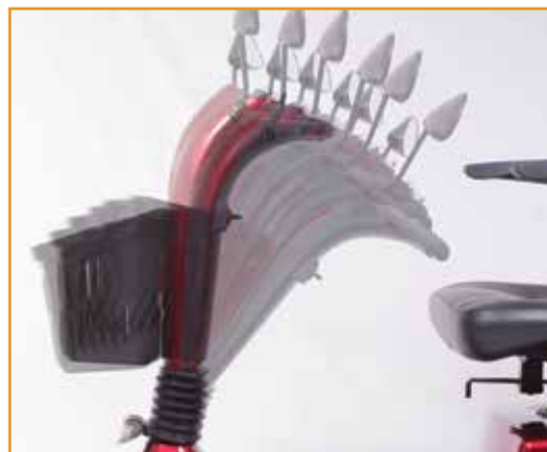
Patented infinite adjustable tiller