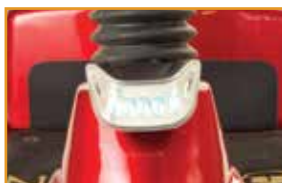
Angle adjustable LED headlight creates a wide path of bright light

1 Battery range at 200 lbs. and will vary due to rider weight, drive surface, terrain, and battery type. 2 Electronics warranty excludes batteries.