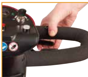
EZ Reach tiller adjustment