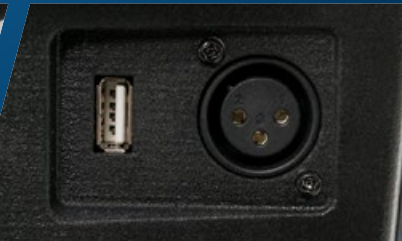
USB charger port in tiller

The Victory® 10.2 offers great convenience and versatility with exclusive feather-touch disassembly and a delta tiller with wrap-around handles. Contemporary features such as the integrated storage/cup holder on the tiller ensure ample storage options, while a new under-tiller puddle light offers improved visibility to both the storage area and USB charging port.