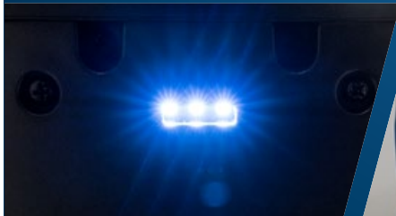
Under-tiller puddle light