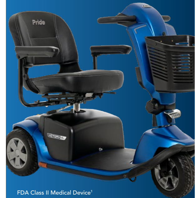
FDA Class II Medical Device 1

CONTEMPORARY FEATURES ENHANCE YOUR ACTIVE LIFESTYLE