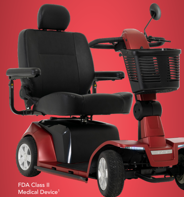
FDA Class II Medical Device 1

ULTRA HEAVY-DUTY FOR MAXIMUM PERFORMANCE