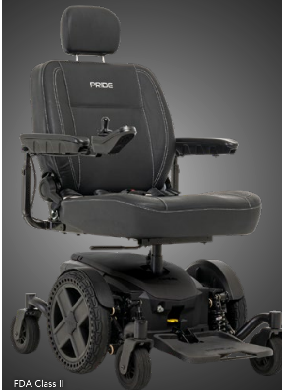
FDA Class II Medical Device 1

AMERICA'S FAVORITE POWER CHAIR Pride Mobility