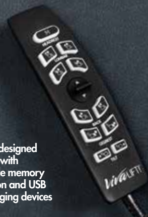
Ergonomically designed toggle remote with programmable memory position button and USB port for charging devices