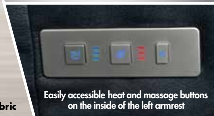
Easily accessible heat and massage buttons on the inside of the left armrest