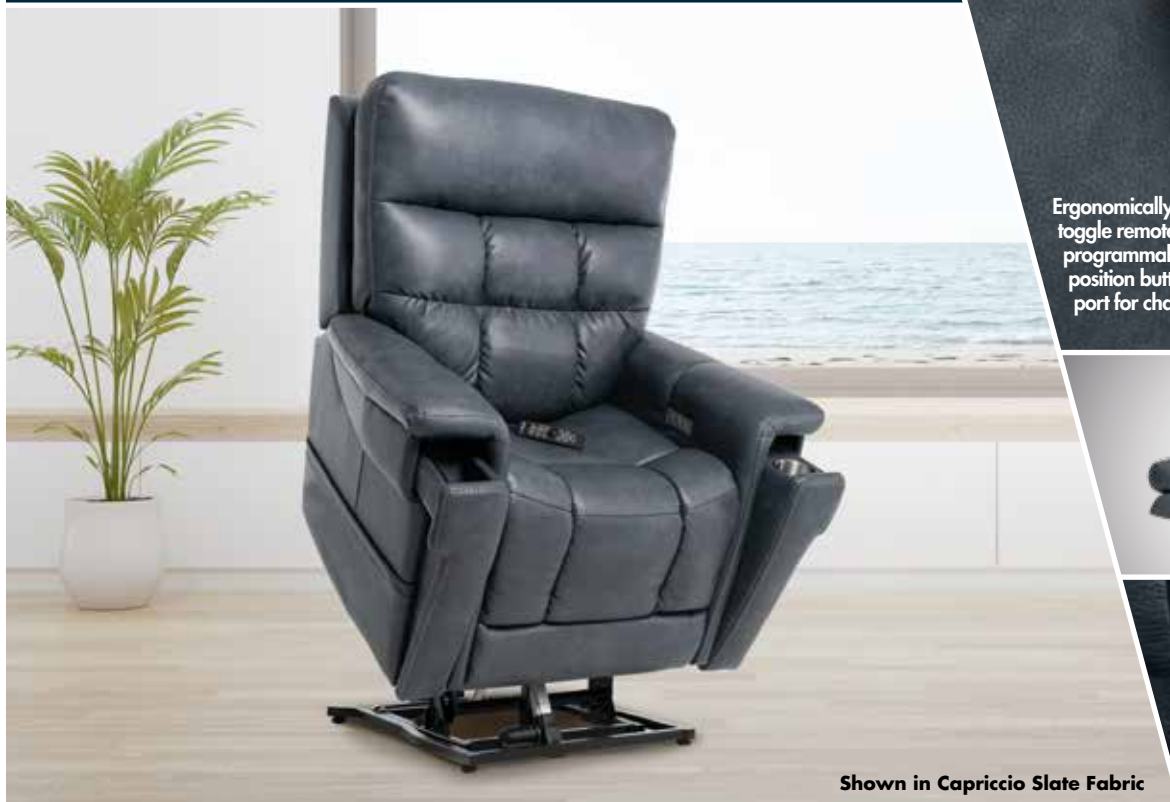
Shown in Capriccio Slate Fabric