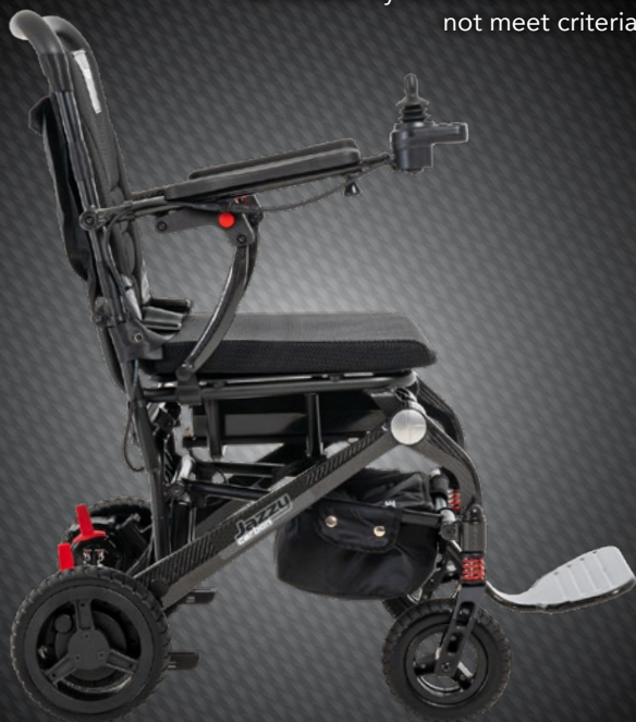
FDA Class II Medical Device 1

Not coded by DME PDAC or does not meet criteria