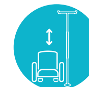
MAKES SITTING AND STANDING EASY