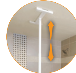
ADJUSTS TO FIT 7' - 10' CEILINGS