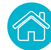
USE IN ANY ROOM