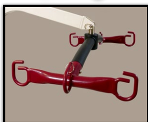
6-point spreader bar maximizes sling options