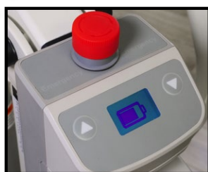
LCD battery level display; audible low-battery indicator