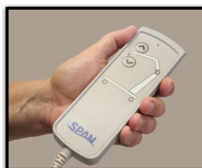
2-button pendant with LED indicator