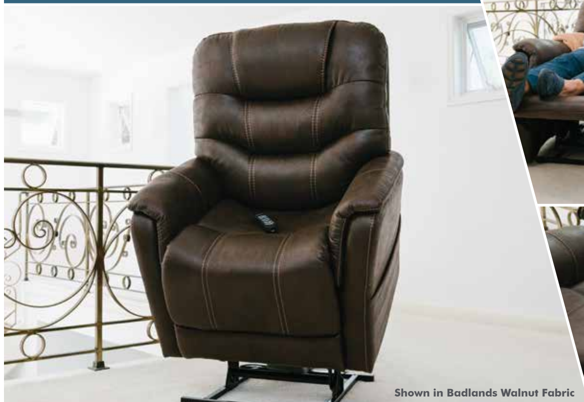
Shown in Badlands Walnut Fabric