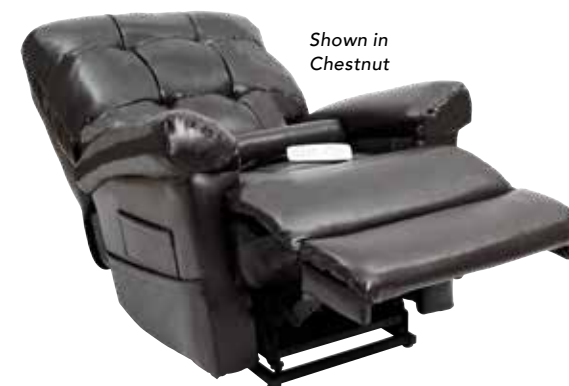
Shown in Chestnut

* Not available with memory button hand control