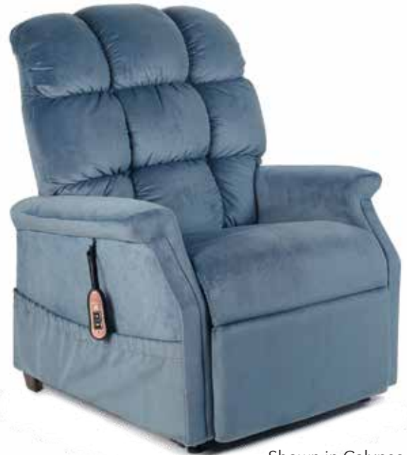
Shown in Calypso

Upgrade with Deluxe Therapeutic Heat & Massage!