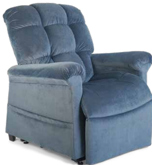
Shown in Calypso

Upgrade with Deluxe Therapeutic Heat & Massage!