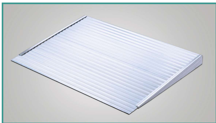
UP TO 2" HEIGHT