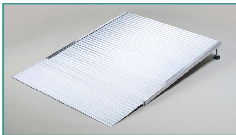
UP TO 6" HEIGHT