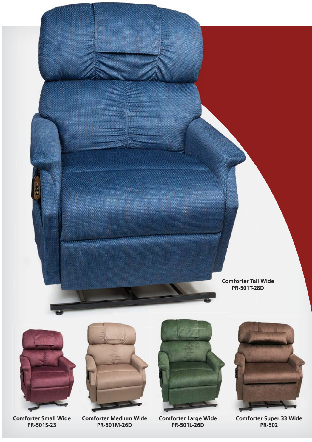
PR-501 S-23, L-26D & T-28D FABRICS